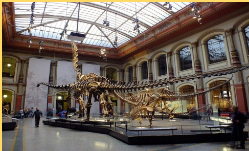
Famous Museum Virtual Tours