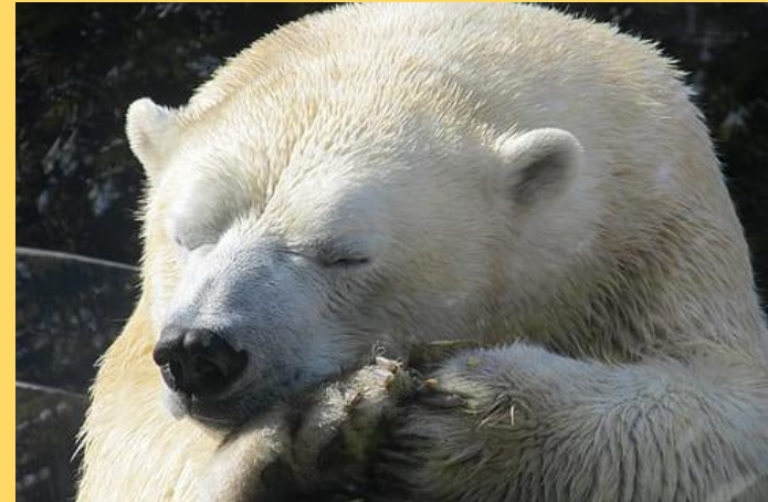
Earthcam Animal Webcams