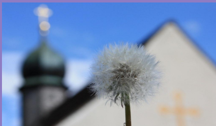
Stress Relief Breathing